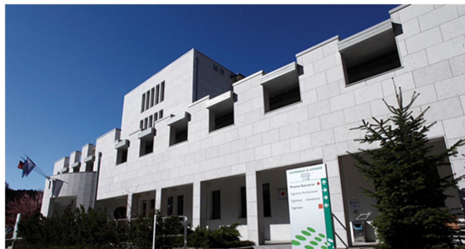
Asiago Hospital, Italy

To introduce MicroPort Orthopedics as a brand and let surgeons get closer to our new entity, the Italian Marketing Team decided to focus on staging multi-regional Medical Education events.